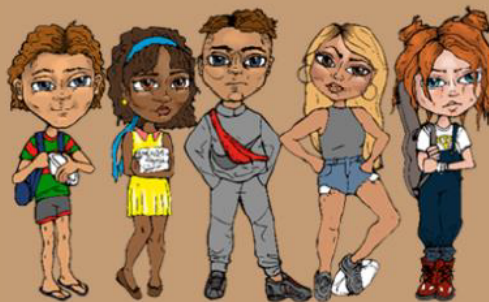
Young People and Risky Behavior training program

We are pleased to announce that Bila Muuji Drug and Alcohol Network have qualified Aboriginal Mental Health First Aid Instructors. The team are taking expressions of interest and can cater to a full service or a mixed group, however this is dependent on interest.